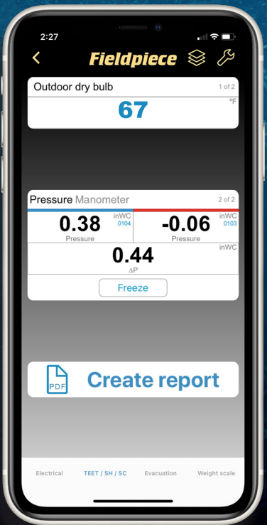
*iPhone Not Included

Short hose length keeps things neat, and independent sensors allow for direct placement on test ports. Measure between zones without snaking a hose past the door where it can be pinched. Dial in gas pressure of a furnace. Optimize total external static pressure of equipment. Pinpoint duct leaks and restrictions. Increase comfort and do more.